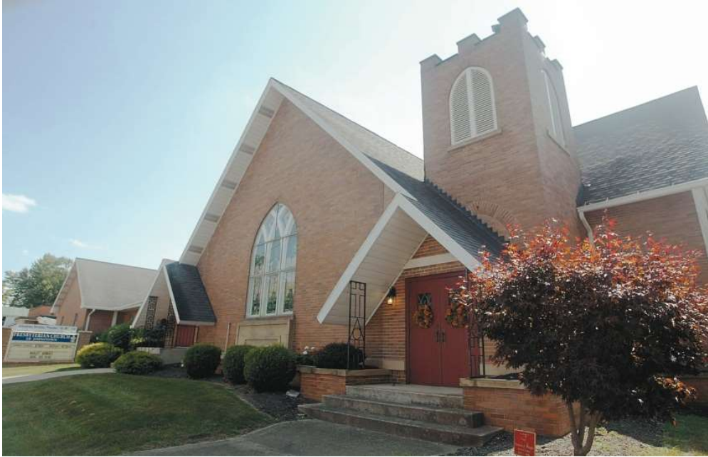
The Presbyterian Church Of Johnstown